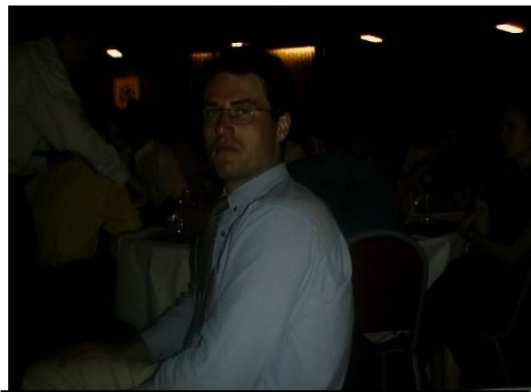
The "initial 2 nd Grade skipper, father to be and 2 nd biggest psycho quick produced by the club