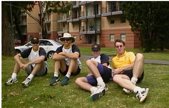
Dodgy 1 st Graders & Coach on "Shalom Hill"

To reflect upon a season that saw us finish on 46 points and in outright 11th spot, it is fair to say that in many ways it was a pleasing and satisfying one. However when you analyse the season and consider that we were on 20 points and in contention for the wooden spoon with only four rounds remaining it puts the season in a different perspective.