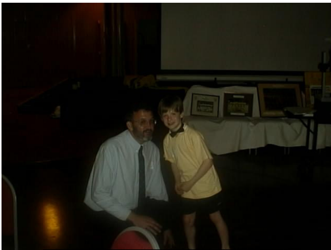
Our leading wicket taker with the son of our finest wicket taker