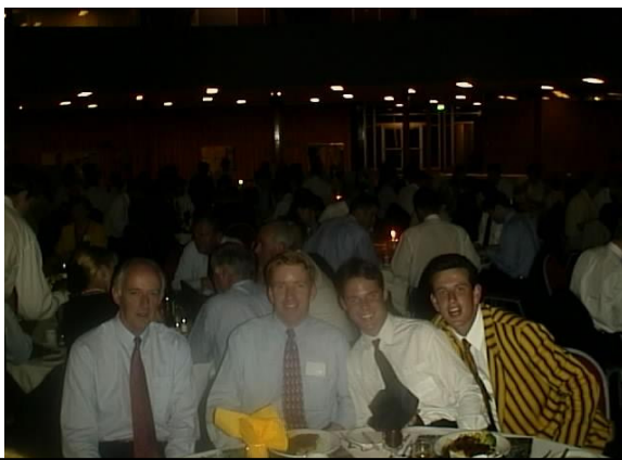
The "last standing" 2 nd Grade skipper plus Tex and prominent old boys – Foundation Dinner