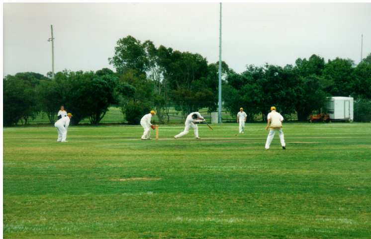
Hitting "in the V" for 4ths vs Fairfield at DP