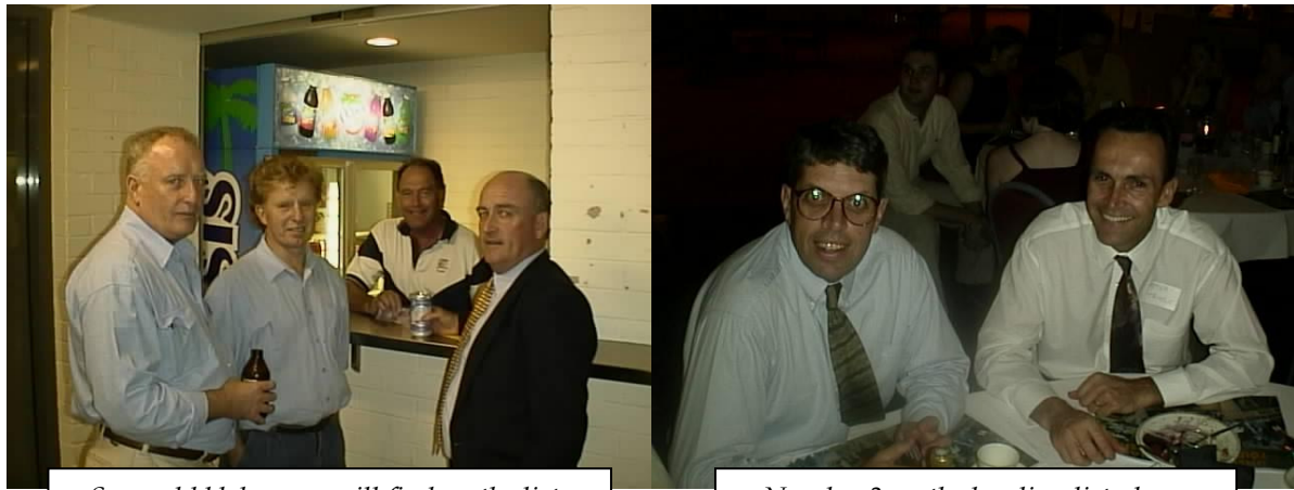
Some old blokes you will find on the lists and one new bloke who sells all the "piss"