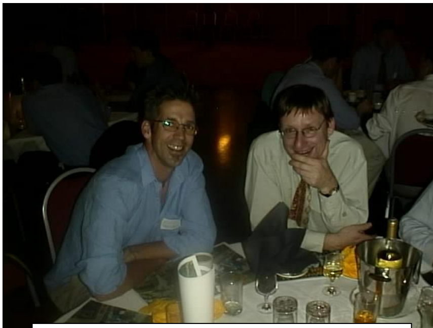
Our leader in dismissals with a man who has scored 1,817 runs in Grade (apparently no hundreds)